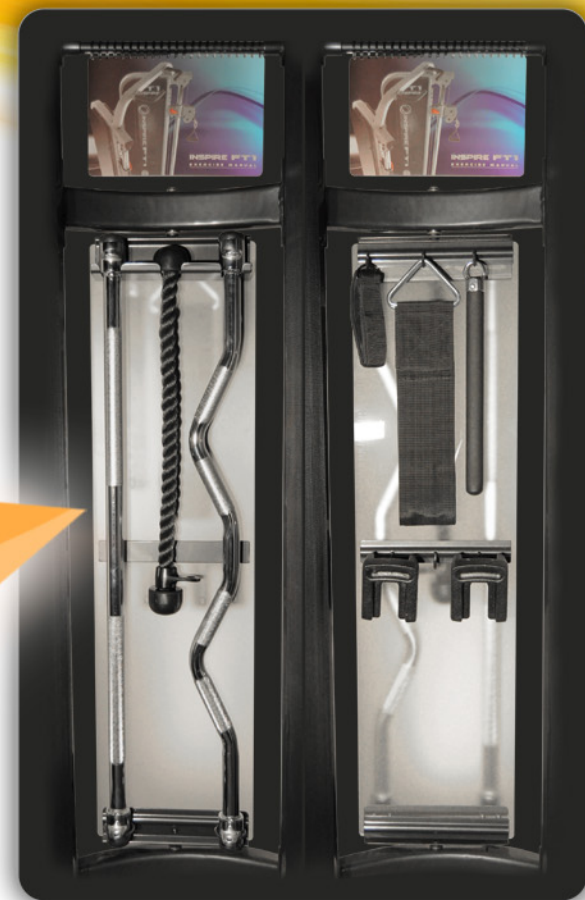
Rotating Accessory Rack