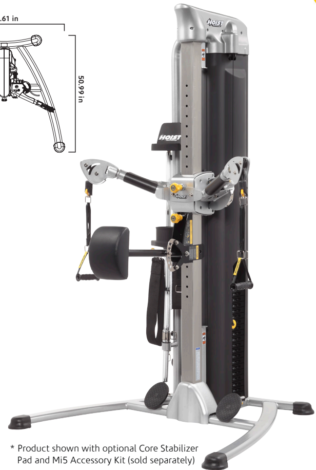
* Product shown with optional Core Stabilizer Pad and Mi5 Accessory Kit (sold separately)